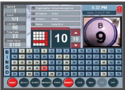
CALLER PLAY SCREEN

The system's user-friendly software features quick reference pop-up screens and expanded programming options with vivid and detailed color graphics and easy-to-follow menus.