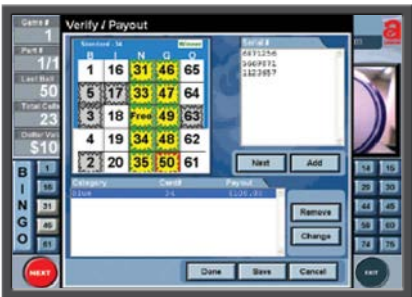
CALLER VERIFICATION SCREEN