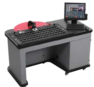
REAR CONSOLE VIEW